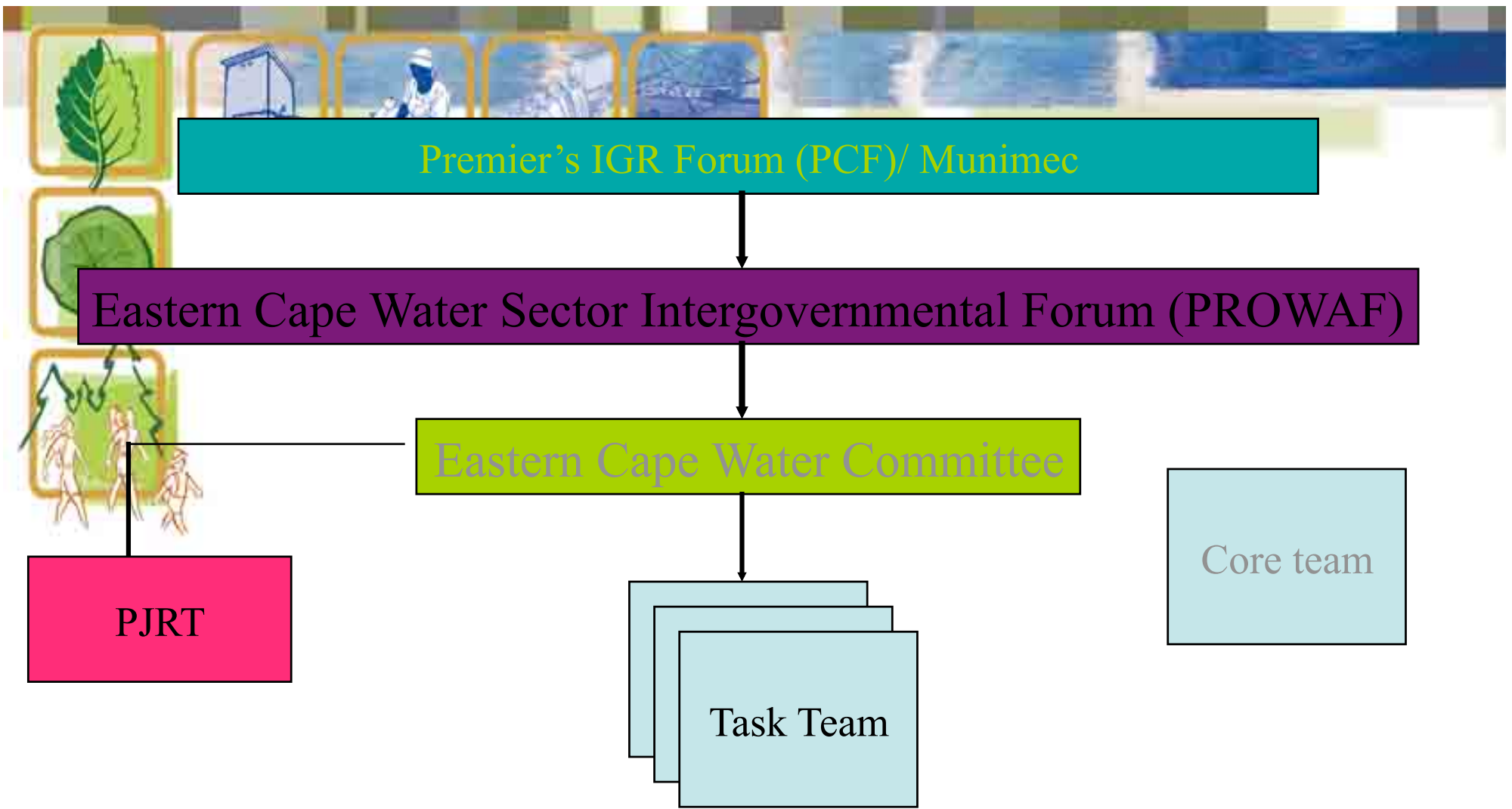
Eastern Cape collaborative structures and linkages to IGR