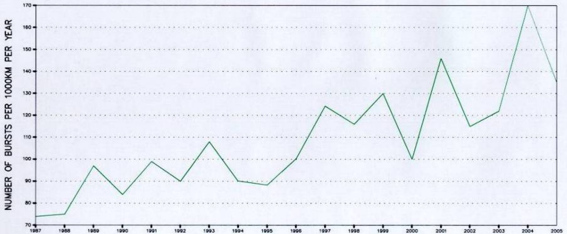
GRAPHIC PRESENTATION OF GRADUAL DETERIORATION OF A LARGE WATER NETWORK

Ideally COCT would be required to spend about R60 million annually to keep burst water mains statistics between 10 & 20 burst/100Km/annum