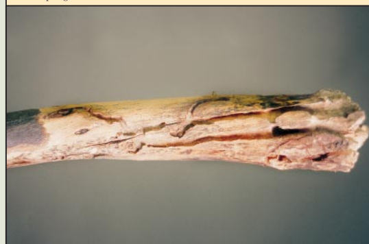
Sesbania stump with bark removed to show damage caused by sesbania stem borer